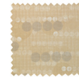
CF Stinson Textiles 240 Bariatric Chair | Fizz Champagne | FIZ 24