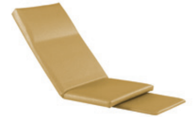
Series RT 404 Replacement Bed Top For Ritter/Midmark® 404