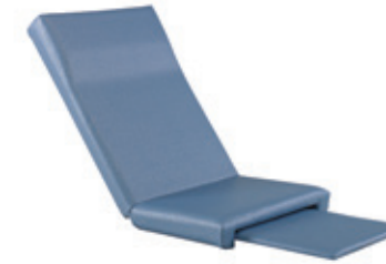
Series RT 104 Replacement Bed Top For Ritter/Midmark® 104