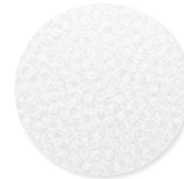
Top Surface White Solid Surface Top