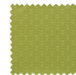
CF Stinson Textiles 201 Arm Chair | Diva Limelight | DVA 49