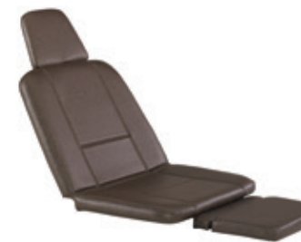
Series RT 411 Replacement Bed Top For Ritter/Midmark® 411

Intensa offers a wide range of colors and patterns to create a new design environment... AT A FRACTION OF THE COST FOR NEW EXAM TABLES.