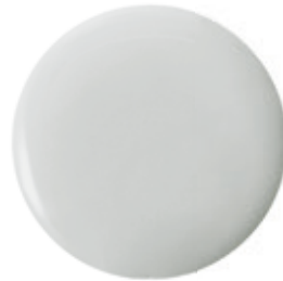
Sherwin-Williams Paint SW 7661 | Reflection