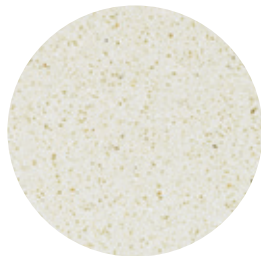
Top Surface Recommend Hi-Macs Classic Moon Haze | GI 18