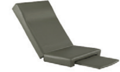
Series RT 304 Replacement Bed Top For Ritter/Midmark® 304