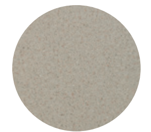
Top Surface Recommend HPL Work Surface Wilsonart® Laminate with 3MM Edge Band | Neutral Glace