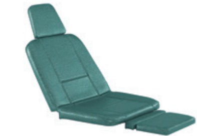
Series 75L Replacement Bed Top For Ritter/Midmark® 75L