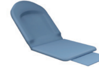
Replacement RT 420 Bed Top For Intensa 420