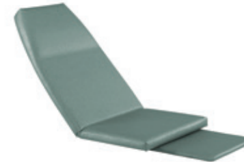
Series RT 405 Replacement Bed Top For Ritter/Midmark® 405