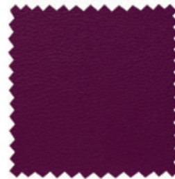
CF Stinson Textiles 201 Arm Chair | Rainier Wildflower | RIR 31