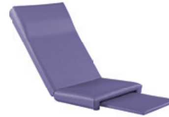
Series RT 100 Replacement Bed Top For Ritter/Midmark® 100

Renewing medical office buildings with new tops not only helps the environment by recycling existing equipment, it also reduces the cost for expansion or updates. This replacement program provides a competitive advantage for increased profits. These new tops can also work as a quick answer to JCAHO inspections and may help avoid the fines and restrictions associated with them.