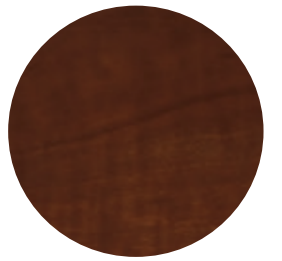
Casework Laminate Pulse Plus Casework | Wild Cherry