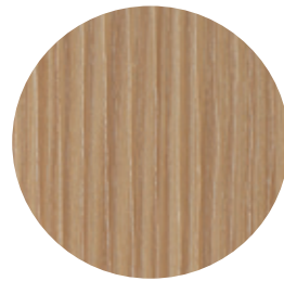
Casework Laminate Pulse Casework | Temino Oak