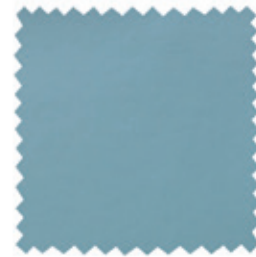
CF Stinson Textiles 962 Physician Exam Stool Apex • Crypton® Revl™ Tranquil | APX 25

Curated specifically for women, this décor creates an atmosphere of calm with warm, soothing colors that will PUT ANYONE AT EASE.