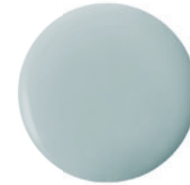
Sherwin-Williams Paint SW 6219 | Rain