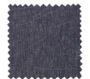
CF Stinson Textiles 951 Physician Exam Stool | Script Purple Passion | SCT 36