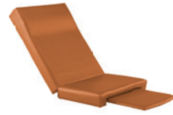
Series RT 223 Replacement Bed Top With Foot Pad