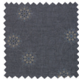
CF Stinson Textiles 420 Exam Bed | Vortexis Cabana | VOR 07