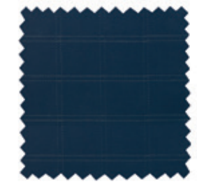
CF Stinson Textiles 973-CB-FR Physician Exam Stool Stitch in Time Skipper | SNT 44