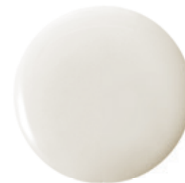
Sherwin-Williams Paint SW6070 | Heron Plume