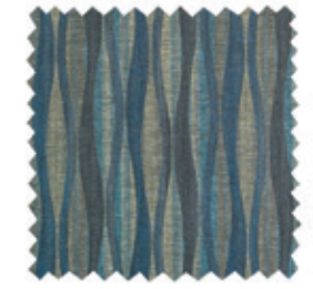
CF Stinson Textiles 460 Exam Bed | Lava Aurora | LAV 11