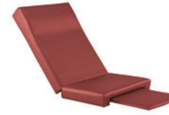
Series RT 204 Replacement Bed Top For Ritter/Midmark® 204