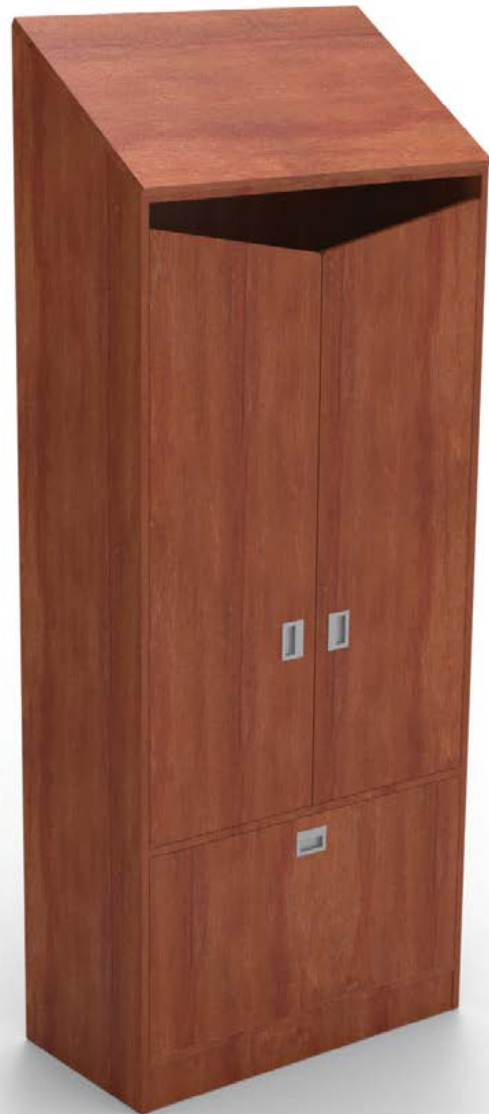
BHW 1000 Slant Door Wardrobe