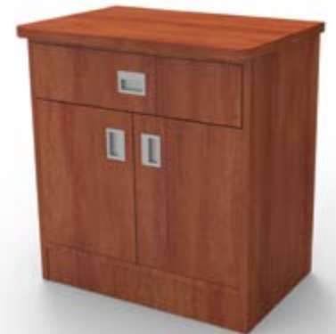
BHC 1005 Single Drawer, Door AV Cabinet/Night Stand