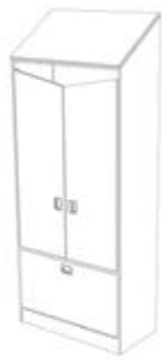
BHW 1000 Slant Door Wardrobe