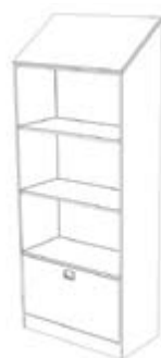
BHW 1010 Wardrobe