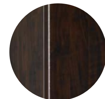
Full-length hinges for strength

Find out more about our products at Intensa.net