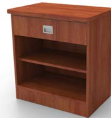
BHC 1000 Single Drawer Shelf/ Night Stand