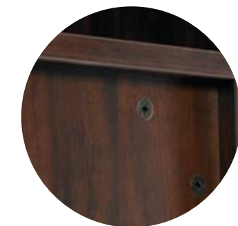
All metal cam locks located in non-accessible locations