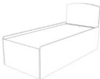
BHB 1000 BHH 1000 Bed & Headboard Requires 80" x 36" mattress (not provided)

Dimensions: 27" width / 29" height / 18.625" depth