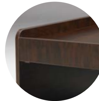
Rounded edges for safety