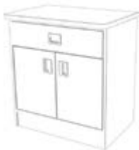
BHC 1005 Single Drawer, Door AV Cabinet/ Night Stand