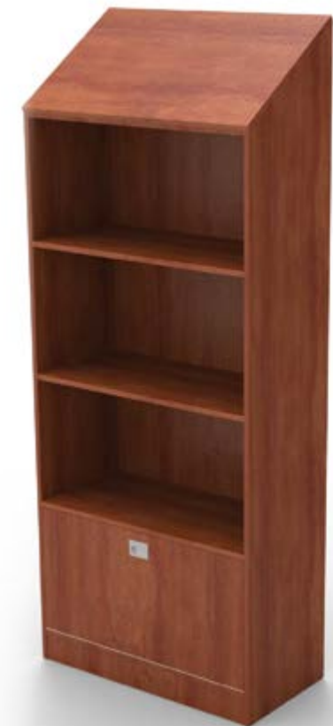
BHW 1010 Wardrobe