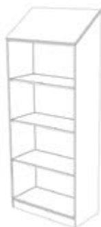
BHW 1005 Shelved Wardrobe