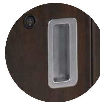
Recessed safety pulls