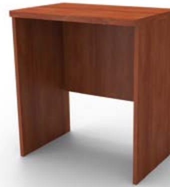
BHT 1000 Desk