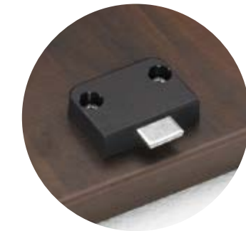
Extended hasp for extra security