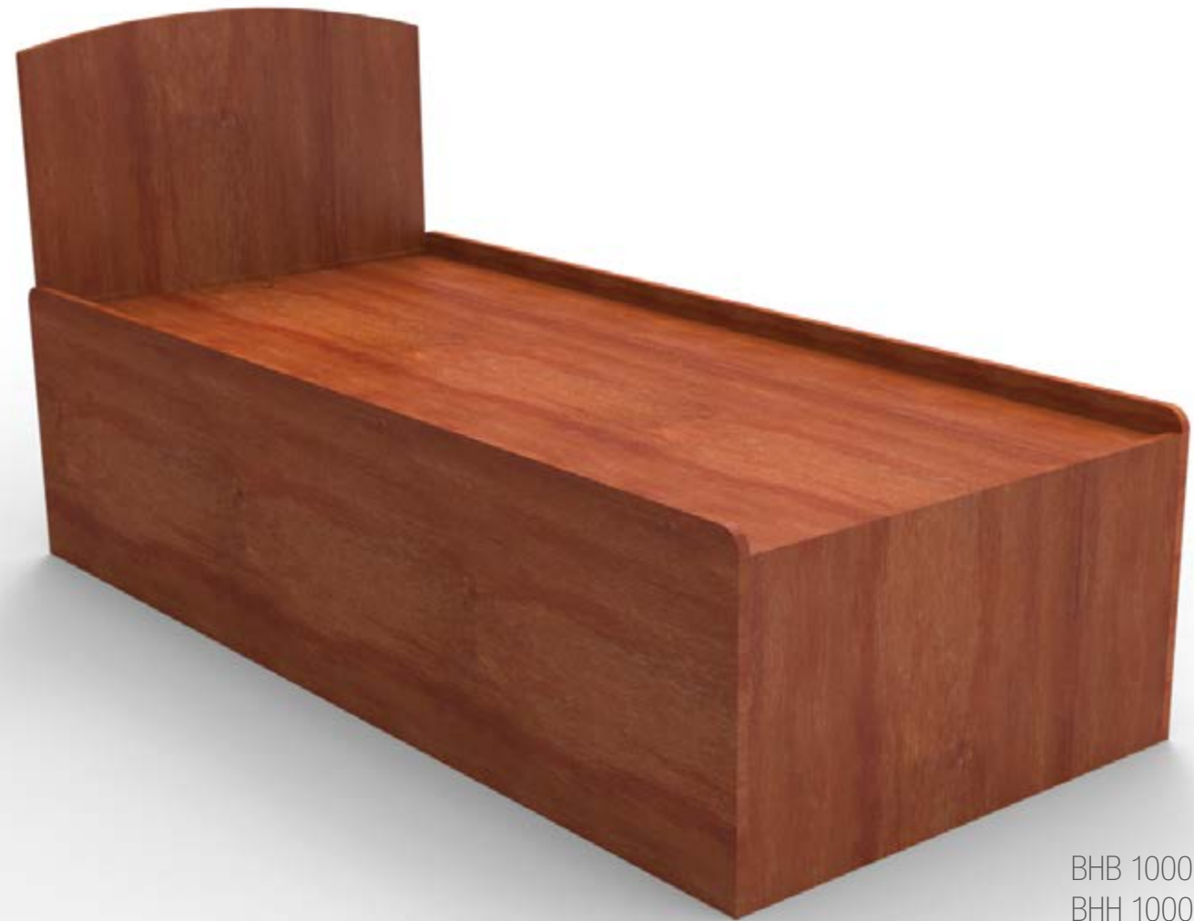
BHB 1000 BHH 1000 Bed & Headboard Requires 80" x 36" mattress (not provided)