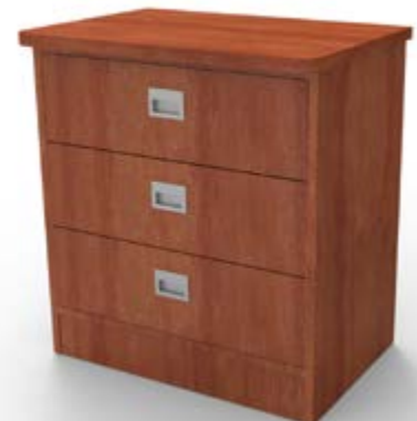
BHC 1010 Three Drawer/ Night Stand