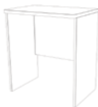
BHT 1000 Desk

Dimensions: 36" width / 90" height / 16" depth