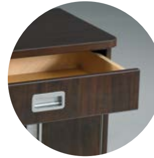
Drawer glide prevents unauthorized removal