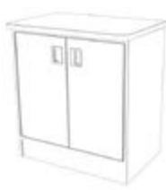
BHC 1015 Door AV Cabinet/Night Stand