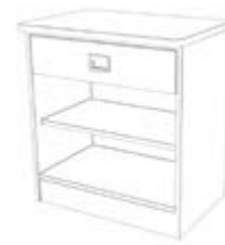
BHC 1000 Single Drawer Shelf/Night Stand