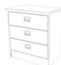
BHC 1010 Three Drawer/Night Stand

Dimensions: 27" width / 29" height / 18.625" depth