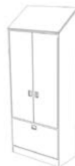
BHW 1015 Closed Wardrobe

Dimensions: 36" width / 90" height / 16" depth