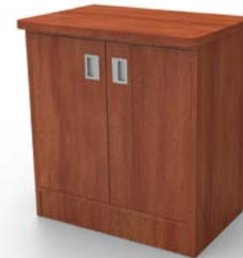
BHC 1015 Door AV Cabinet/ Night Stand