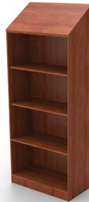
BHW 1005 Shelved Wardrobe