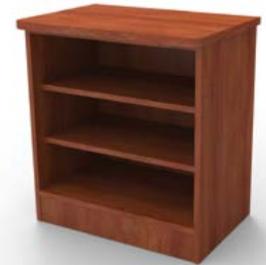
BHC 1020 Open Shelf Night Stand