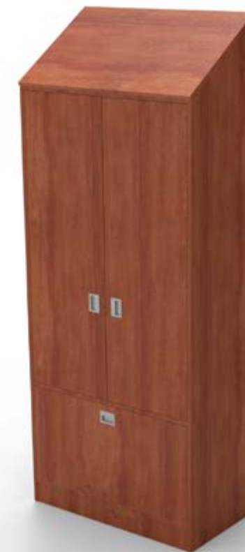
BHW 1015 Closed Wardrobe