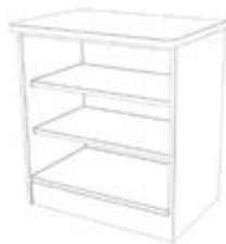
BHC 1020 Open Shelf Night Stand