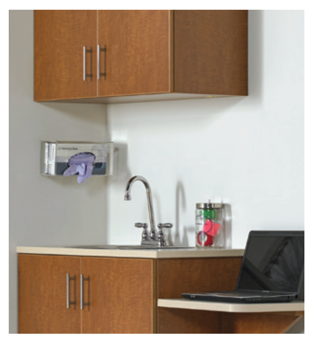
Casework Laminate Essentials Casework | Nina Maple