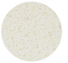
Top Surface Recommend Hi-Macs Classic Moon Haze | GI 18

Casework Laminate Pulse Casework | Temino Oak