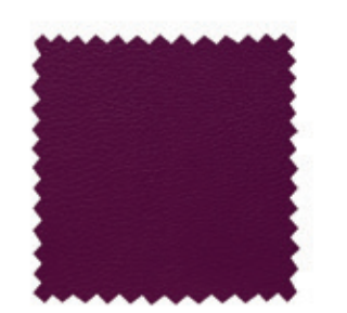
CF Stinson Textiles 201 Arm Chair I Rainier Wildflower I RIR 31