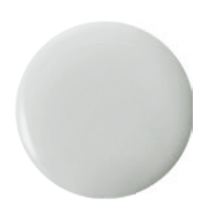
Sherwin-Williams Paint SW 7661 | Reflection