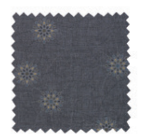
CF Stinson Textiles 420 Exam Bed | Vortexis Cabana | VOR 07