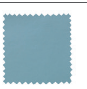
CF Stinson Textiles 962 Physician Exam Stool Apex • Crypton<sup>®</sup> RevI™ Tranquil I APX 25