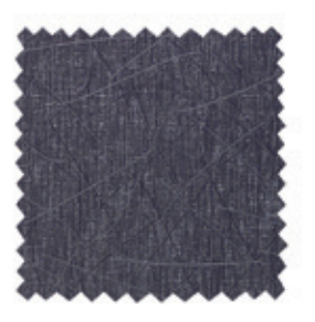
CF Stinson Textiles 951 Physician Exam Stool | Script Purple Passion | SCT 36