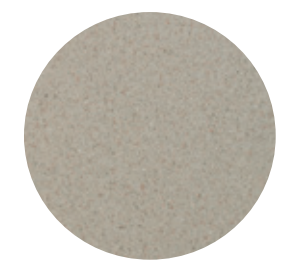
Top Surface Recommend HPL Work Surface Wilsonart® Laminate with 3MM Edge Band | Neutral Glace