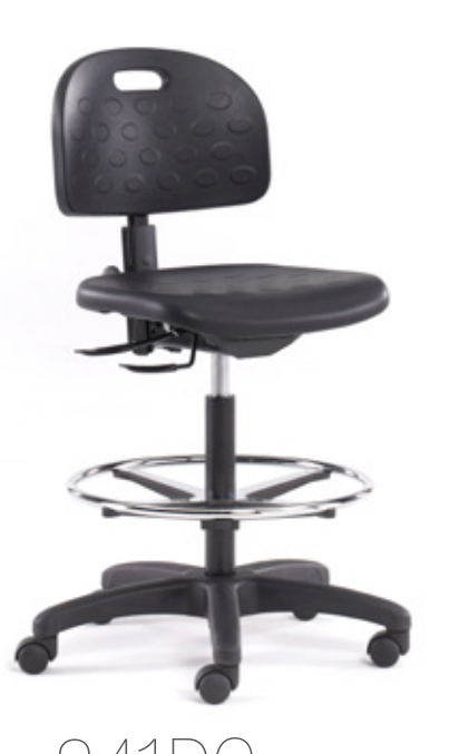
Self Skin Ergonomic Laboratory Chair Seat & Back Tilt Black Composite Base