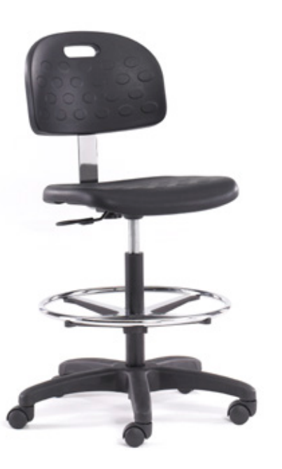
Self Skin Ergonomic Laboratory Chair Adjustable Back Rest - In/Out Black Composite Base Meets ISO3 Clean Room Standards