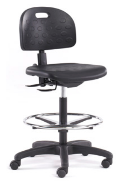
Self Skin Ergonomic Laboratory Chair Seat & Back Tilt Black Composite Base Meets ISO3 Clean Room Standards