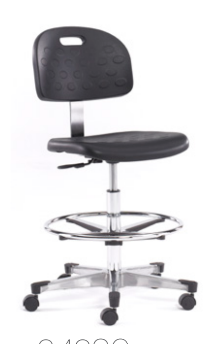
Self Skin Ergonomic Laboratory Chair Adjustable Back Rest - In/Out Aluminum Base with Toe Caps