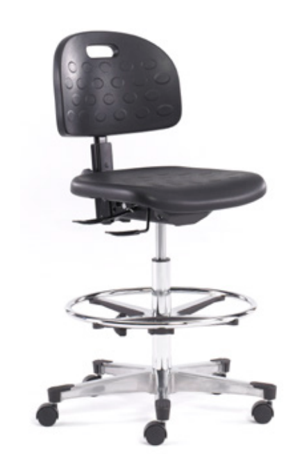
Self Skin Ergonomic Laboratory Chair Seat & Back Tilt