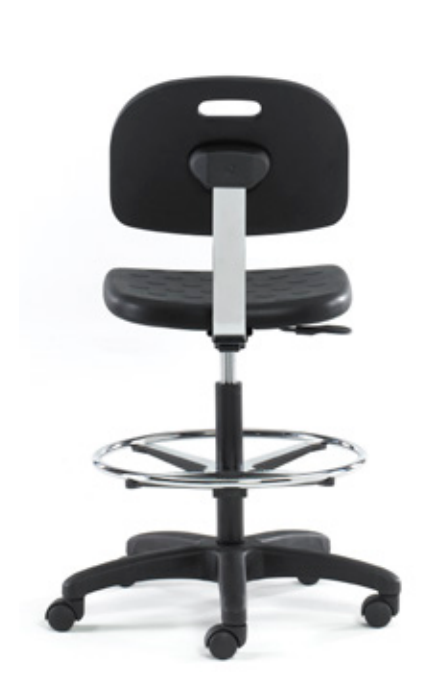
Self Skin Ergonomic Laboratory Chair Adjustable Back Rest - In/Out Black Composite Base