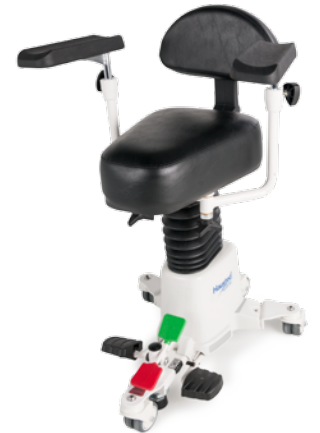
HSS500-W WEDGE SEAT STYLE