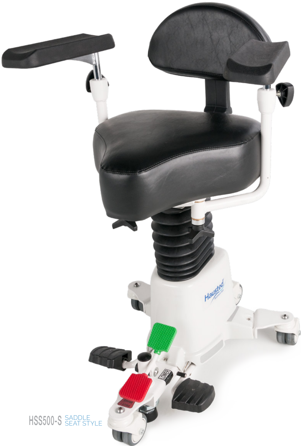
HSS500-S SADDLE SEAT STYLE