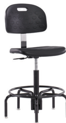
848SC Black Tubular Five-Leg Steel Base with Glides