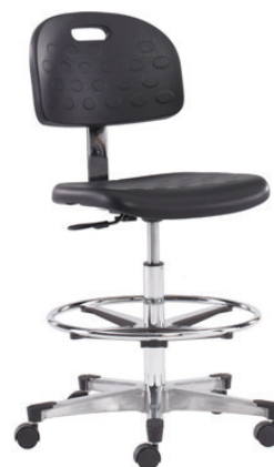
842SC Brushed Aluminum Base with Toe Caps