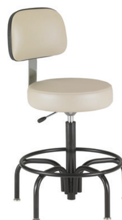
868 Black Tubular Five-Leg Steel Base with Glides

Color Variations Swatches are digital reproductions. Perceived texture and coloring may vary on finished product. Monitor or printer settings will effect appearance of color.