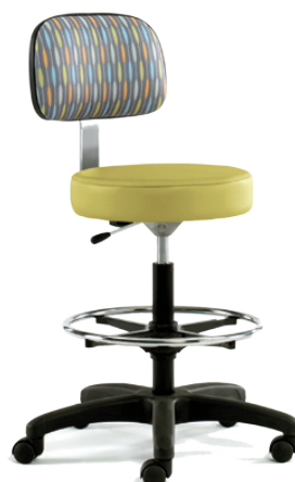
861 Black Nylon Composite Base