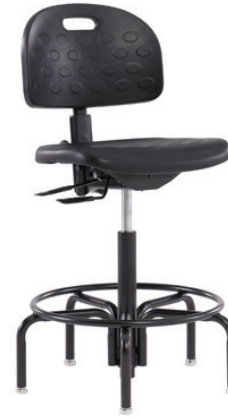
848DC Black Tubular Five-Leg Steel Base with Glides