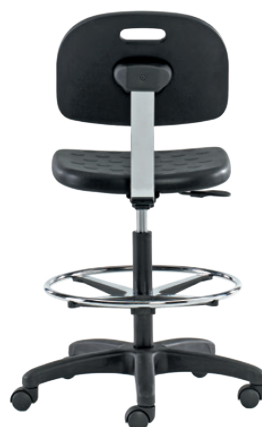
841SC Black Nylon Composite Base