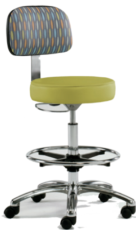
873 Polished Aluminum Base