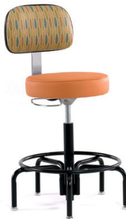
878 Black Tubular Five-Leg Steel Base with Glides