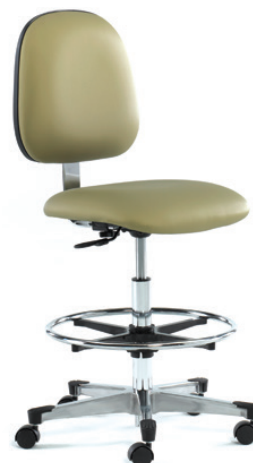
812 Brushed Aluminum Base with Toe Caps