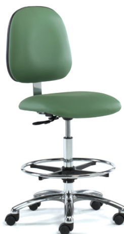
813 Polished Aluminum Base