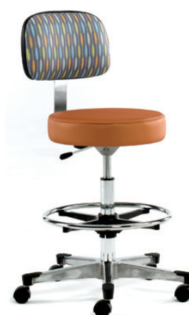
862 Brushed Aluminum Base with Toe Caps