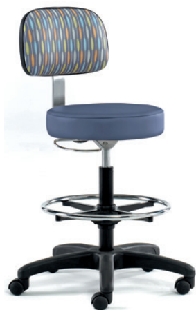
871 Black Nylon Composite Base