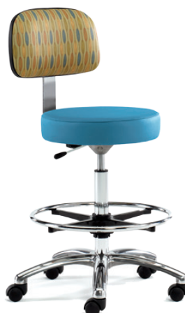
863 Polished Aluminum Base