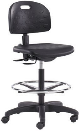
841DC Black Nylon Composite Base