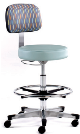
872 Brushed Aluminum Base with Toe Caps