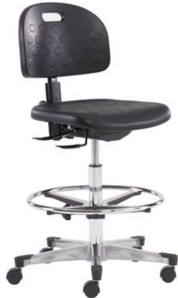
842DC Brushed Aluminum Base with Toe Caps