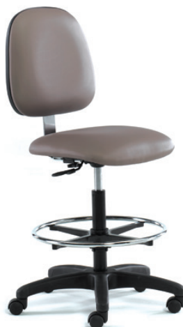
811 Black Nylon Composite Base