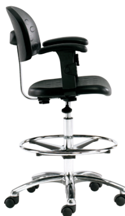
843SC-T Polished Aluminum Base with optional Arm Rest