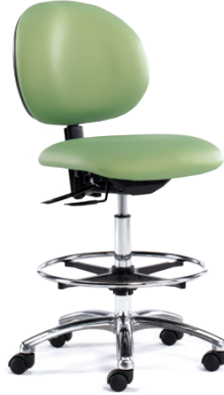
833 Polished Aluminum Base