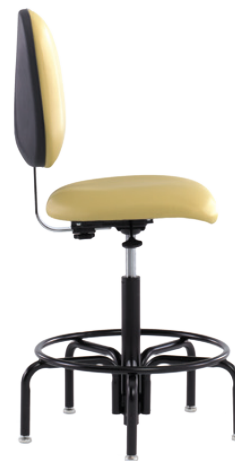
818 Black Tubular Five-Leg Steel Base with Glides

Color Variations Swatches are digital reproductions. Perceived texture and coloring may vary on finished product. Monitor or printer settings will effect appearance of color.