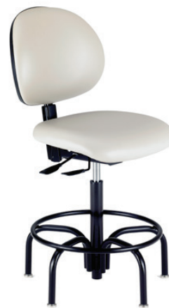
838-7 Black Tubular Five-Leg Steel Base with Glides and Low Height Range Cylinder