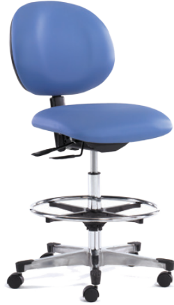
832 Brushed Aluminum Base with Toe Caps