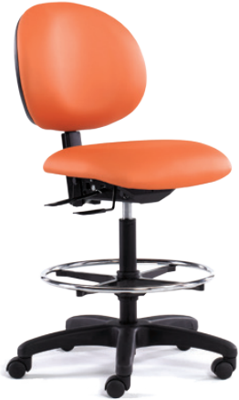
831 Black Nylon Composite Base